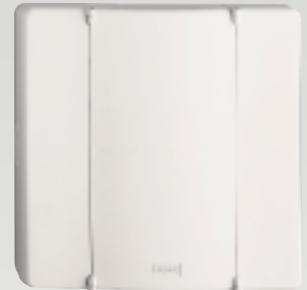
Main Control Panel