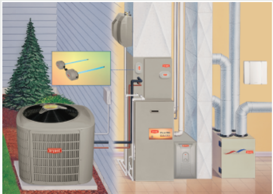
Central Air Conditioner and Gas Furnace System