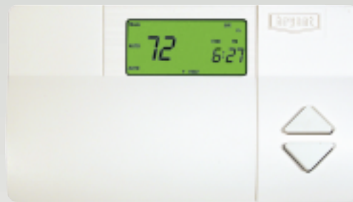
Zone Perfect Plus™ Thermostat