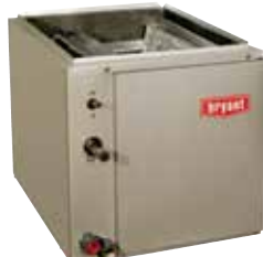
Model CNPVP/T Vertical Cased N-Coil Transition Width