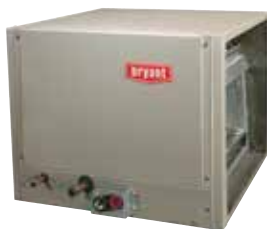
Model CNPHP Horizontal Cased N-Coil